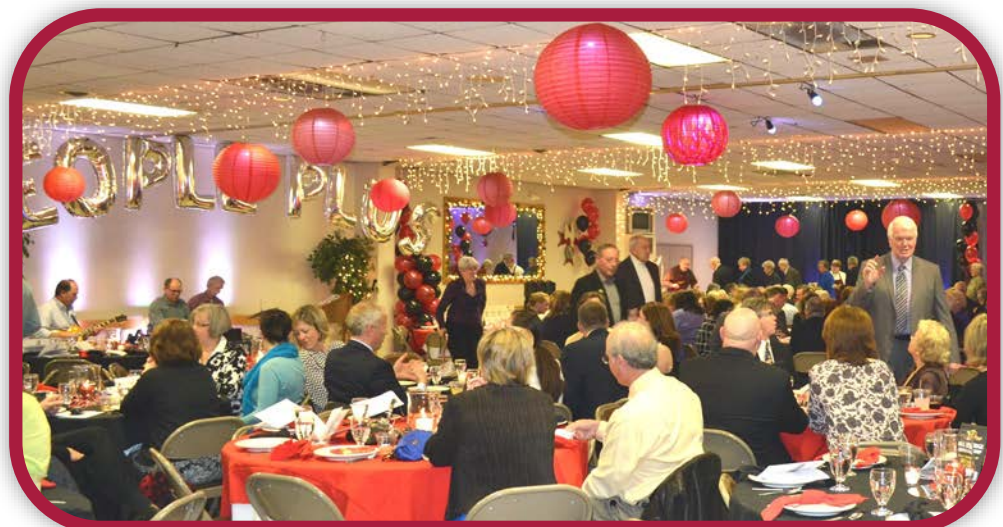
Music in April 2015 was our most successful fundraiser yet.

Over 200 volunteers provided over 7,000 hours of service this year in the areas of Community Outreach, Activities, Programs, Administration and Fundraising.