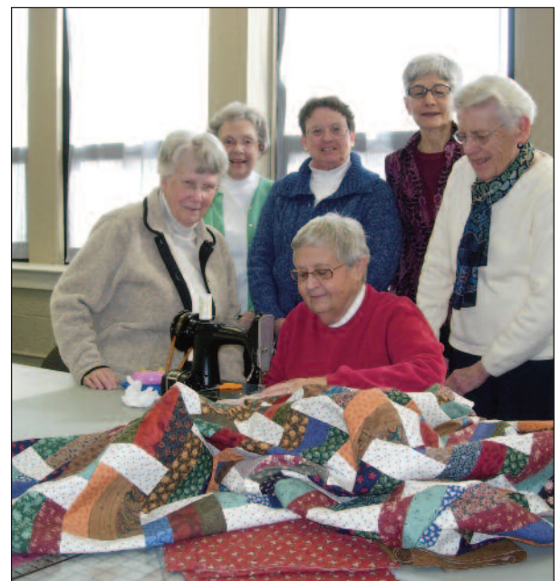
Our talented quilters donated a quilt that was auctioned off at the Music in April fundraiser.