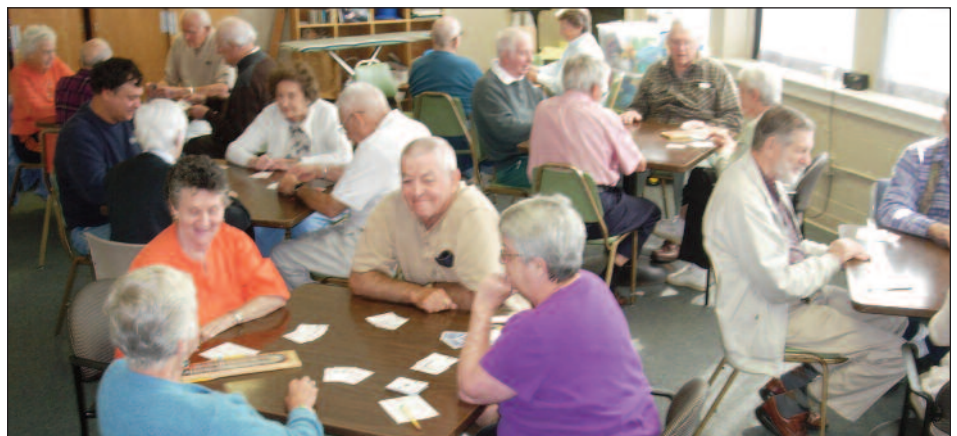
Pinochle is a favorite activity for many People Plus members.

During the year, over 20 volunteers provided almost 1,000 free rides for 53 riders. They made multiple pick ups helping people without access to transportation reach vital services to meet their needs. The transportation program's 2011-2012 operations were supported by grants from the United Way and the Maine Health Access Foundation.