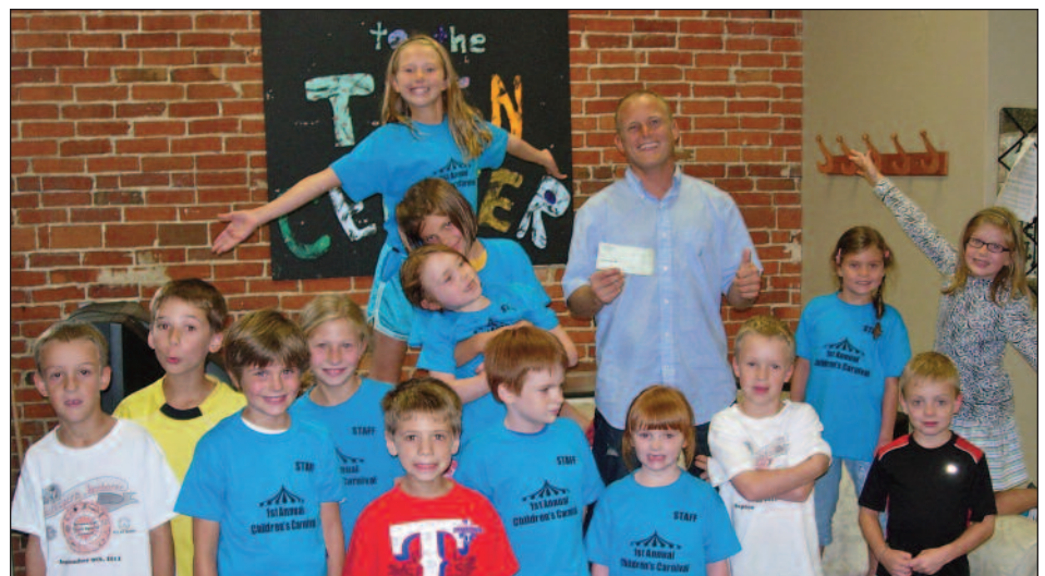
Children in a summer math-enrichment program put on a carnival that raised nearly $700.