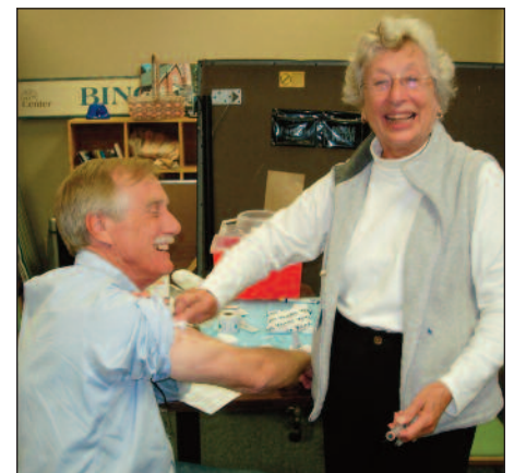
Former Governor Angus King came to People Plus for his flu shot.