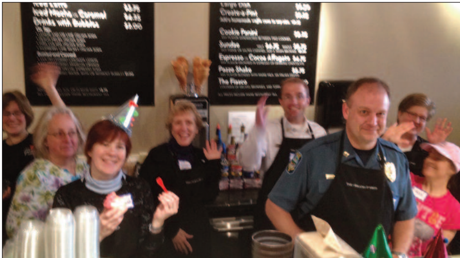
The Gelato Fiasco fundraiser for the Teen Center is a community favorite.