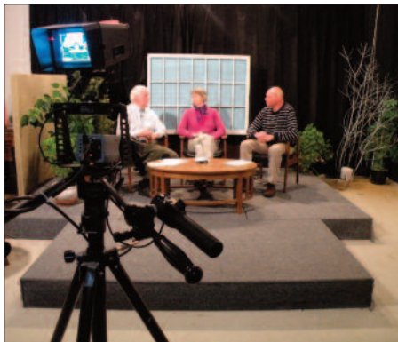
News and Views is taped in the studios of Harpswell Community Television.

AARP tax aides helped 179 people prepare their income taxes at People Plus in 2011.