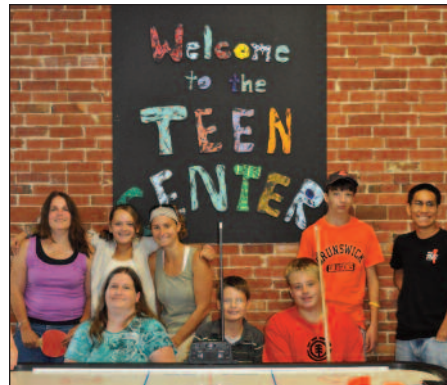
The Teen Center is a safe place to meet friends and have fun after school.

Special thanks go to the Gelato Fiasco whose "Fool's Day Fiasco" raised $2,515 for the teens and to Shaw's Supermarket whose Frito-Lay promotion raised $750.