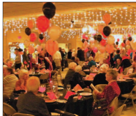
Music in April offers good food, live music, exciting auctions, pleasant company, and a great time.