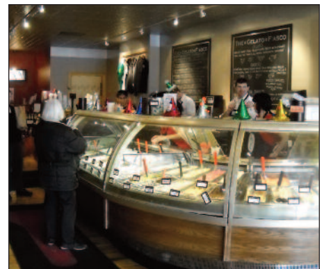
Celebrity scoopers work for the Teen Center at the "Fool's Day" event at Brunswick's Gelato Fiasco.