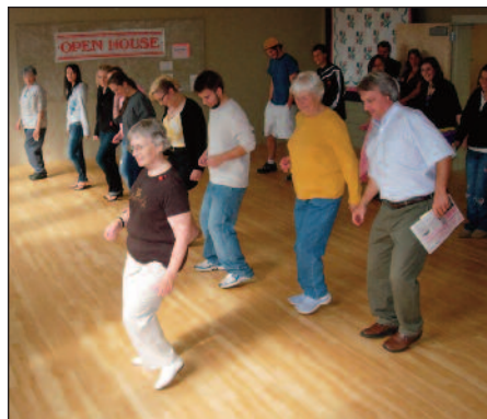
Visitors to People Plus try out a free dance class during the September 2010 Open House Week.

News and Views: People Plus has its own interview-format public interest cable television program, "News and Views." A new 30-minute program is recorded each month, and shown several times each week on local public access channels. In 2011, "News and Views" was broadcast 251 times.