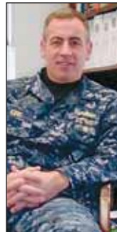
NAVY CAPT. JAMES T. KIRK

The talk is open to the public and free of charge. Please call the Center’s information desk at 729-0757 to register.